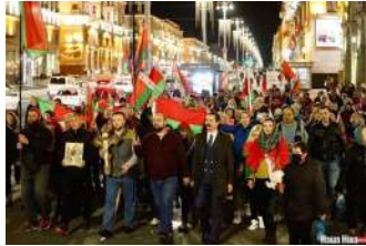
Campaign “For Belarus!” in Minsk